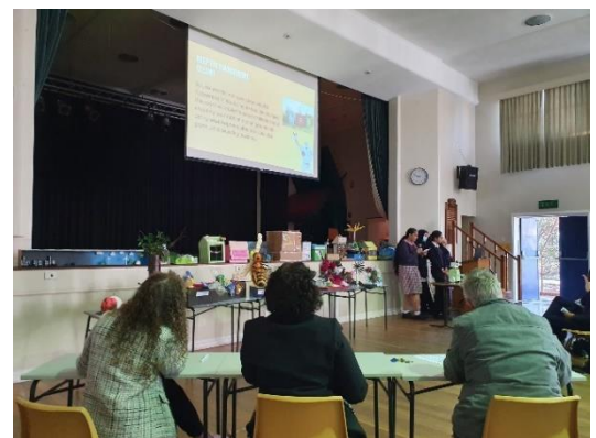
By: STEAM Team