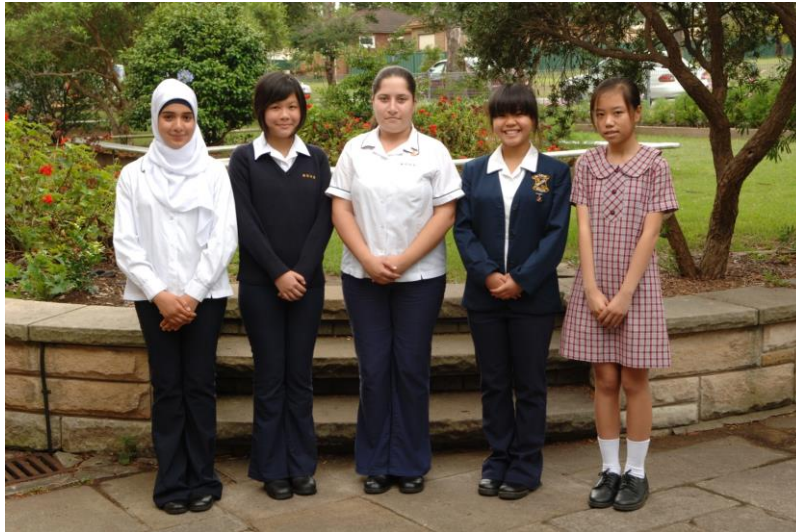
Junior Girls' Uniform – Years 7, 8, 9