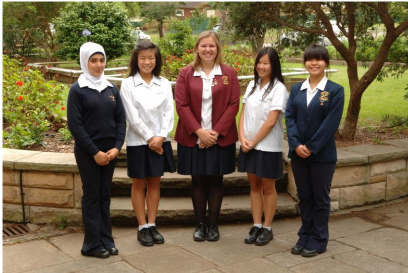
Senior Girls' Uniform - Years 10, 11, 12 (Prefects in maroon school blazer)