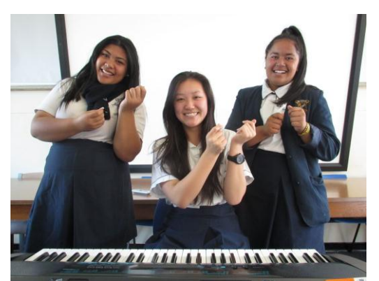
Musicians at the Business Brunch provided wonderful entertainment for guests