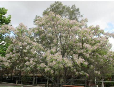
The white cedar tree is in full bloom

Our school grounds are truly beautiful in spring. Students are encouraged to enjoy the flowering gardens and show great pride in our school by maintaining a litter free environment.