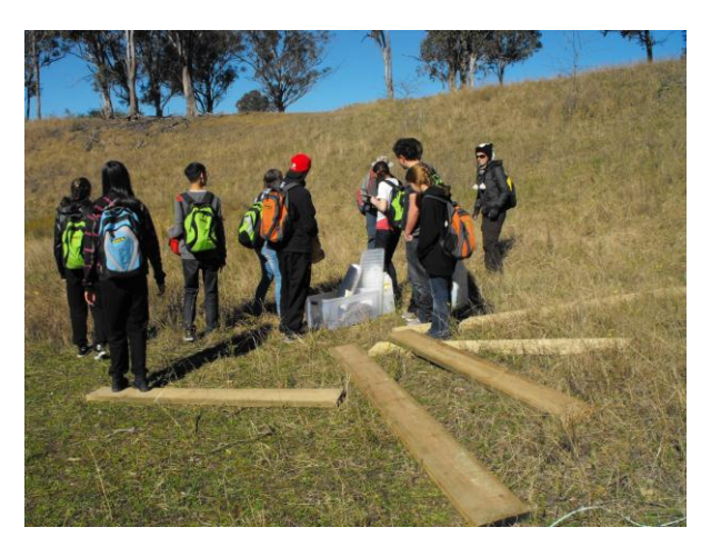
Wooglemai Environmental Education Camp