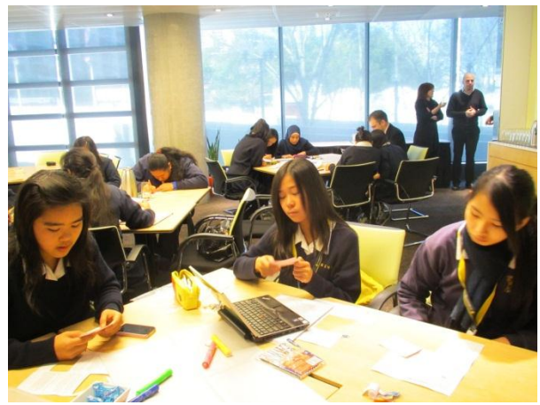
Year 10 students at the SCOPE sessions

Twenty students from Birrong Girls Hiah participated in the Commonwealth Bank Business Simulation Program (SCOPE) that ran across two terms. The program consisted of 4 sessions, each running every fortnight. The aim of the program was to design a proposal for a smartphone application. We were divided into 4 groups. Each group had 2 mentors from the Commonwealth Bank. We learnt about aspects of project management, oral presentation skills, and how to create a project plan. These skills will help us later in the workforce. There were many great ideas for our smartphone applications. One group created a shopping application called 'Cha Ching'. Another group made a social interactive game called 'My Story'. The third group made an application called 'The Find', an application that notified people when there was a sale. Lastly, the winning group proposed an online ticketing application for train commuters which they named 'PocketTix'.