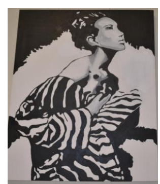
African Queen by Rima Ali