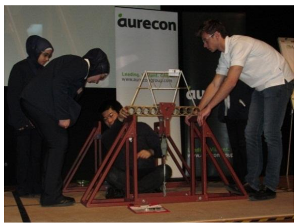
The Aurecon Bridge Building Competition

On Friday 10 August, three Year 9 students represented the school at the Aurecon Bridge Building Competition at the Art Gallery of NSW. After weeks of planning and building, the girls' bridge was able to support 10.2kg (an increase of over 2kg on last year). Although the girls were not successful in winning, they enjoyed the competition and opportunity to test their design against others.