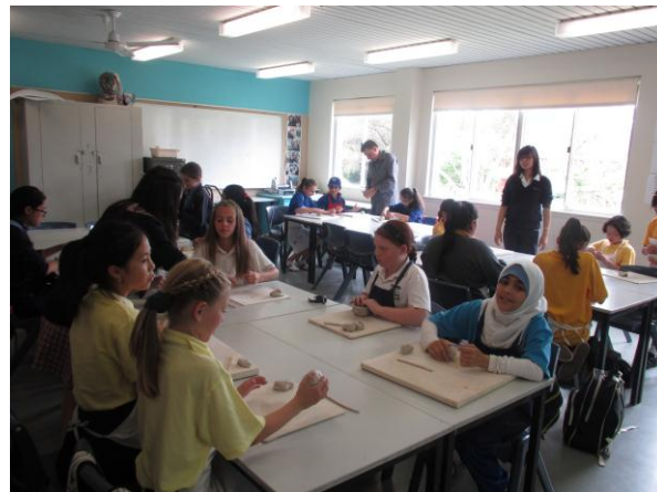
The students had a lot of fun creating pinch pots

On Thursday 15 November, Year 4 and Year 5 students from five local primary schools participated in a whole day enrichment program where they took part in various interesting activities such as baking muffins, playing music and sporting games, creating artwork and participating in a challenge quiz.