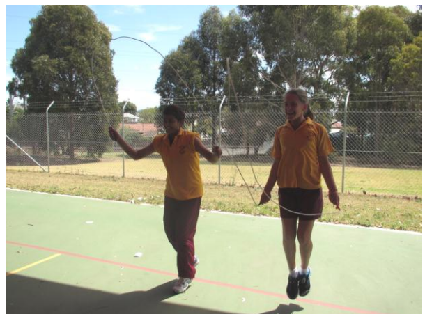
An energetic afternoon of skipping