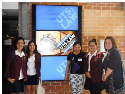
Year 11 students were assisted by a law graduate at the UTS:LAW Open Day