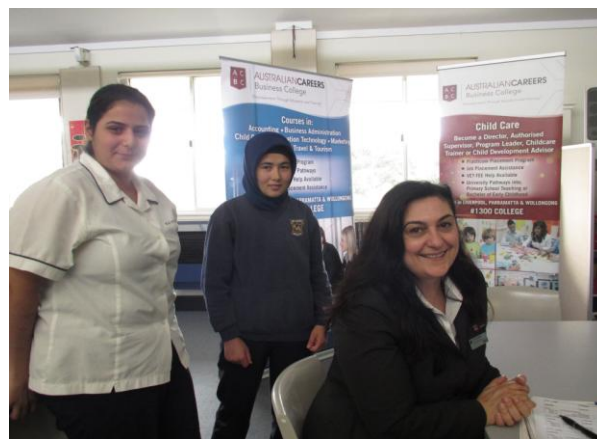
Year 12 students (with a representative from the Australian Careers Business College) begin to plan for life after Year 12

You need to do some research at www.jobguide.deewr.gov.au