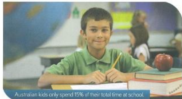
Australian kids only spend 15% of their total time at school.

Australian kids only spend 15% of their total time at school. They spend more time asleep than they do at school. So we need to maximise every day to get full value. That means turning up to school every day, on time.