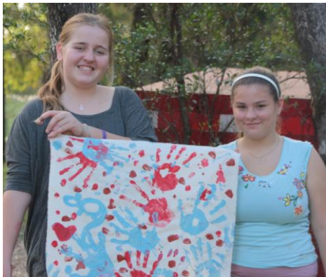
Students participated in a painting activity