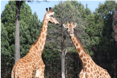
The giraffes were majestic