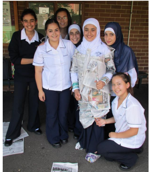
Year 7 students and their Peer Support Leaders

"Because of Peer Support I feel much better about high school and I am more confident."