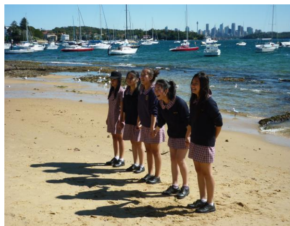
Year 8 students at Watson's Bay