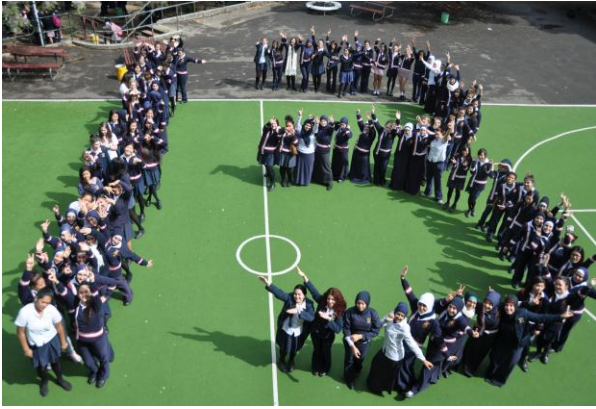
Year 12 graduating class of 2013