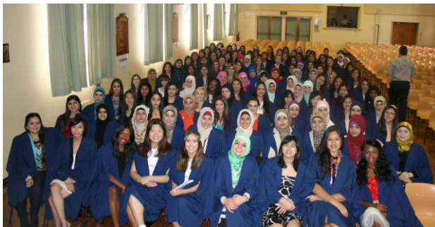
Year 12 Graduation

Our Year 12 girls marked the end of their years at Birrong Girls at the joyous, and for some, emotional Graduation Ceremony held on Friday 20 September. Wearing their formal graduation robes, the girls were presented with their final reports in front of an enthusiastic crowd of very supportive parents and guardians.