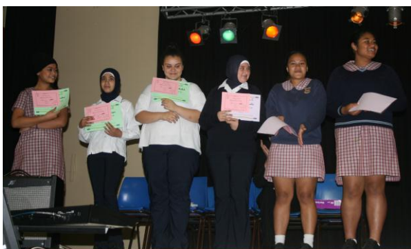
QuickSmart presentation during assembly