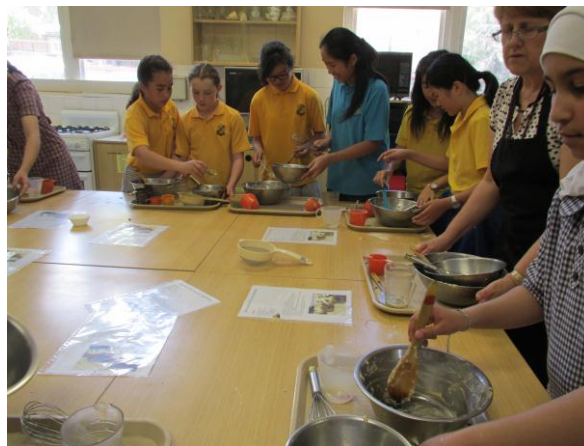
Enrichment Day activities

On Wednesday 13 November, Year 4 and Year 5 students from five local primary schools participated in a whole day enrichment program at Birrong Girls. Students enthusiastically took part in various interesting activities such as drama, using science equipment, baking muffins, creating art work and a team challenge quiz.