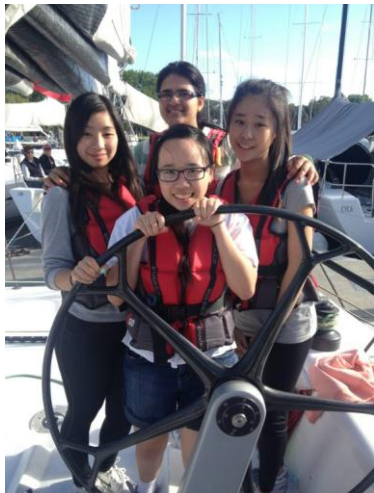
Geared up and ready to sail!