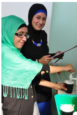
Year 11 Hospitality students worked with TAS teachers to provide morning tea for the staff