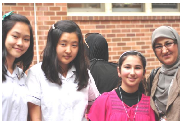
Year 11 helpers informed Year 7 about school clubs