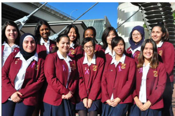
Prefects at Darling Harbour after attending the International Women's Day Breakfast