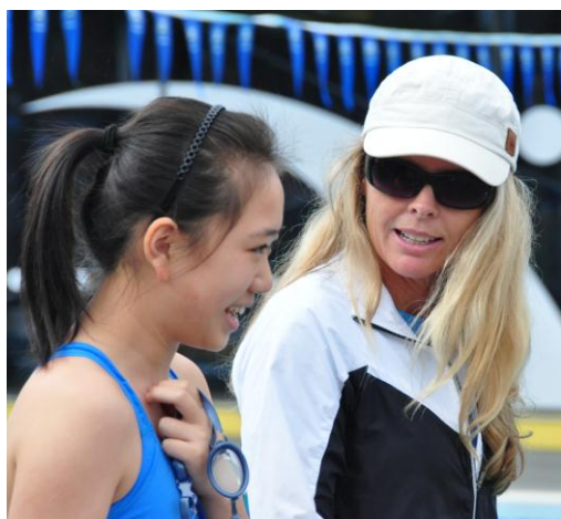
Ms Lord discusses strategies with a student prior to the race