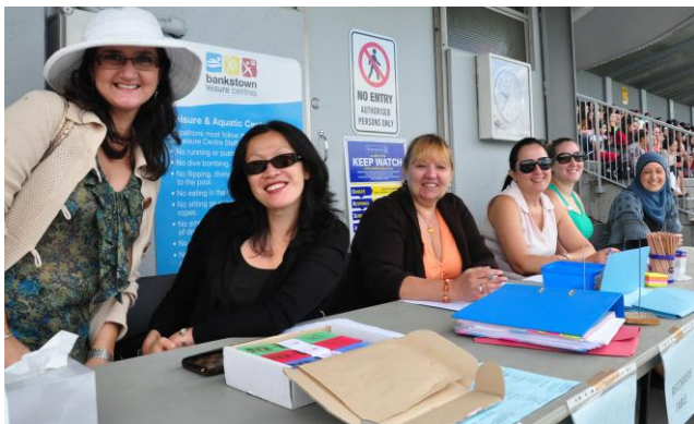
The teachers who were recording results were busy all day