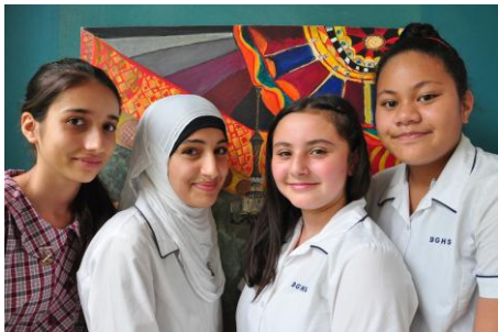
Year 8 SRC

The SRC is made up of students elected by their peers. You may have seen SRC members serving refreshments at Parent/Teacher evenings.