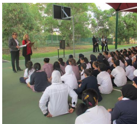
ANZAC Day Commemoration