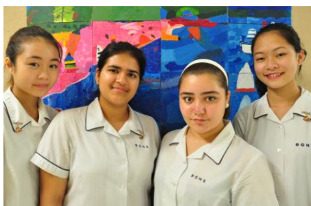
Year 11 SRC