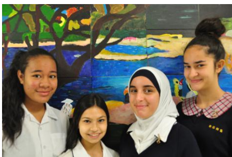
Year 9 SRC