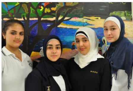
Year 10 SRC