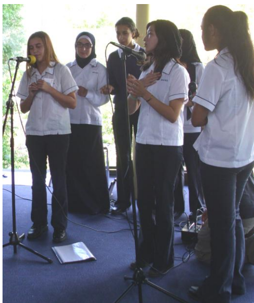
Birrong girls performing a musical item

On 8 April, six fortunate Year 9 students from the Environment Team had the opportunity to visit Taronga Zoo for the 2013 Youth Environmental Network Conference. Before attending we were asked to prepare a PowerPoint display that could be shown on the day about what Birrong Girls High School did to be environmentally sustainable. Along with some other students, we also prepared a musical performance which was held during morning tea.