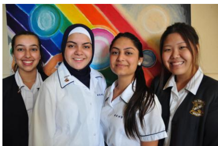
Year 12 SRC