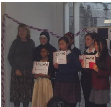
Auburn Future Writers Awards Presentation