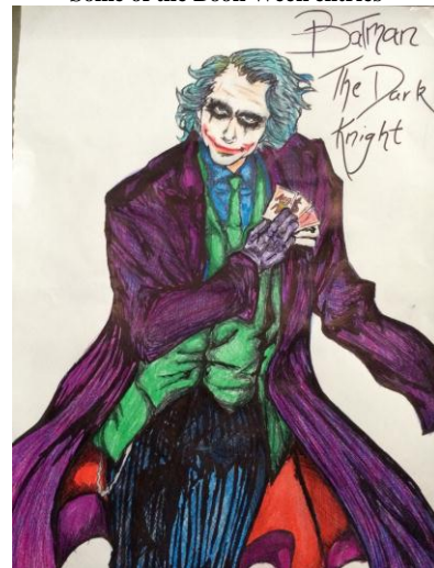
Some of the Book Week entries