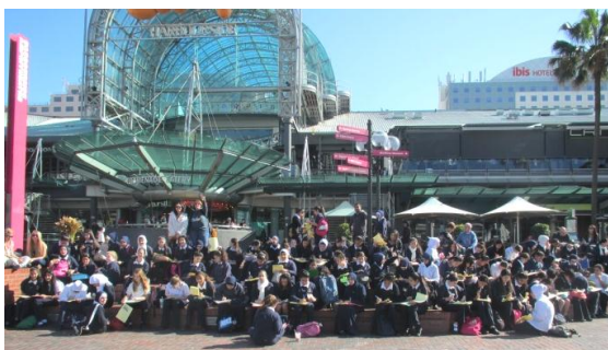
Year 7 students completed their excursion workbook after lunch at beautiful Darling Harbour

Students and other visitors listened carefully to the crocodile keeper when he talked about Rex, a patient and clever hunter. We learned that salt water crocodiles wait by the riverbanks, with only their nostrils and eyes above the water, ready to pounce on anything unlucky enough to come close! Their green-grey colour means they are perfectly camouflaged under the water, and they can hold their breath for over two hours! They can feast on anything including cattle and water buffalo, grasping them with their fearsome teeth and performing the incredible "death roll", where they spin their bodies around to drown their prey and twist pieces off, ready to be devoured. After the zoo, we walked across the Pyrmont Bridge with our teachers to the food court at Harbourside Mall.