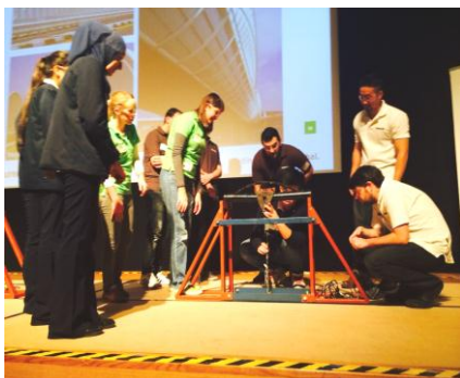
Our bridge being tested

Catching a train to the city with Ms Gallard, we walked down to the Art Gallery of NSW where the testing was to take place. After checking in, snapping a few pictures and weighing the bridge (198g) we were interviewed by the judges. They asked questions about the construction and how we achieved the curved shape of the arch. A hair straightener can come in handy when you try to curve a piece of wood! We were ranked first on aesthetics and now needed to see how much weight our bridge would hold.