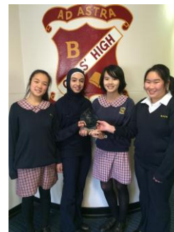
Year 9 debaters