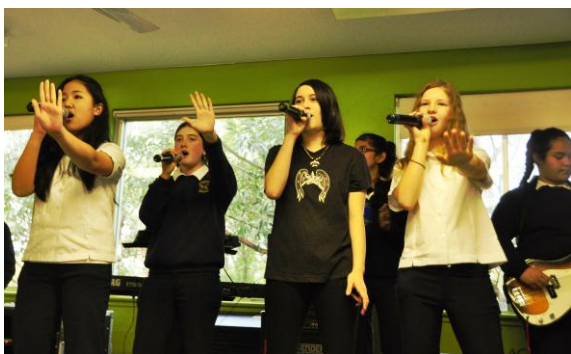
Our talented performers kept the audience entertained

Our annual showcase of student talent held in our Visual Arts centre on Tuesday 19 August was another resounding success. All visitors enjoyed the high standard of student art on display and had the opportunity to nominate their favourite piece for the People's Choice Award. It was a pleasure to view so many great artworks while our talented singers and musicians entertained with lively performances and our Hospitality students supplied us with delicious food.