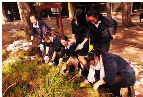
The Year 10 Environment Team have been working hard to improve the quality of our pond