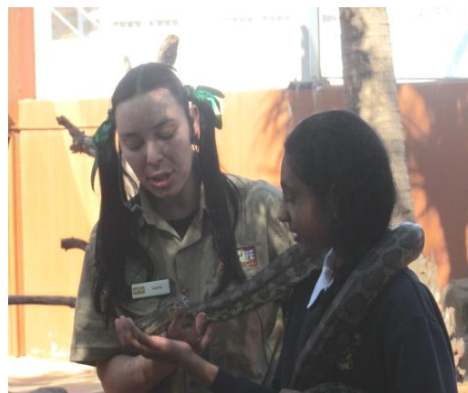
A student volunteered to wrap a giant python around her neck. Students were allowed to touch and feel different reptiles.

Butterfly Tropics was the first display upon entering the Wildlife Zoo. Students were amazed at the diverse range of animals living in the carefully-created tropical habitat, butterflies flitting through lush ferns and palms and vividly coloured pythons sunning themselves among the vines and slithering through the thick undergrowth.