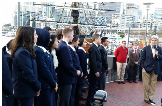
US Secretary of State, John Kerry, addressed a select group of Sydney high school students