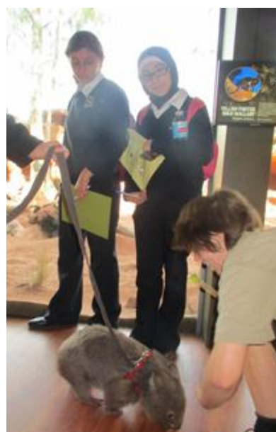
Students observing zoo keepers training Ringo, a bare-nosed baby wombat. When he was found, Ringo was three months old and weighed under 900g. Bare-nosed wombats are naturally found in the coastal regions of south-east Australia and Tasmania.