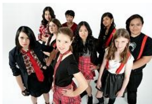
"Ad Astra" band

https://www.youtube.com/watch?v=9kX7x8rV0TE&feature=youtu.be