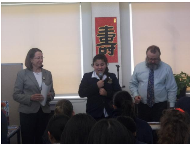
Book Week Presentations