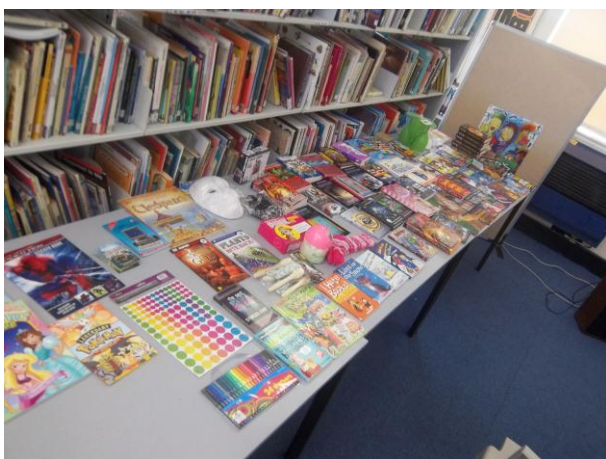
Book Week prizes