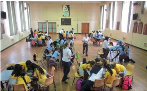
Year 4/5 Enrichment Day

The school's Welfare Team members would like to thank all the parents and guardians for their support and encouragement of our students throughout the year. We wish all the students and their families a wonderful school vacation and look forward to a very successful 2016 school year.