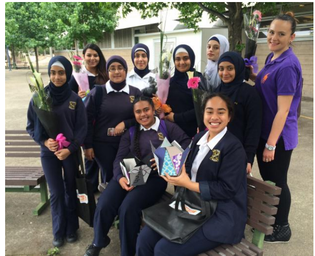
Taste of TAFE workshop day

On Wednesday 11 November the Year 9 Work Education class attended a Taste of TAFE workshop day at Lidcombe TAFE. The students were able to choose to participate in 3 different workshops including Floristry, Events, IT, Building, Hairdressing and Beauty, Design, Electro technology and many more. This event gave our students the chance to experience a taste of various courses and career pathways in a "hands on" environment. Students were also able to view TAFE facilities and speak to current students and staff about training and career options. The Year 9 Work Education class were enthusiastic, eager to learn and commended on their exemplary behaviour. All students and myself had a wonderful day at the TAFE and learnt a lot of new and valuable knowledge and skills.