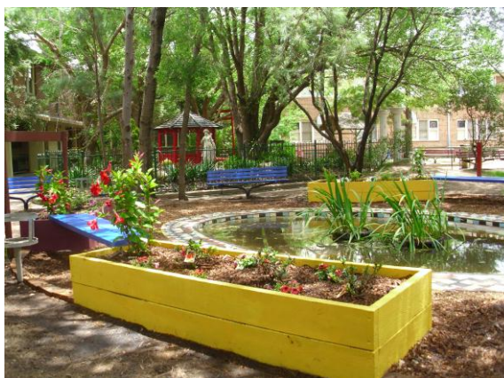
The restored pond as it looks today

Most of all, my thanks and appreciation go to the students of the 2014 Environment Team. May the team of 2015 be as enthusiastic and industrious as you were. You will be a hard act to follow.