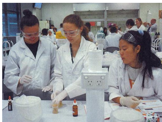
UTS Summer School

students at the University of Technology? On graduation evening teachers and parents heard about how Business students pitched ideas for small business ventures and then had to create business plans; Engineering and Information Technology students designed and created computer games with striking animations or created amazingly animated robots; Health students practised suturing wounds and delivering babies from very life like dummies; Science students investigated diseases such as those caused by the ebola virus which they studied under the microscope looking for markers to confirm their judgements; Creative Design students conceived some astonishing ideas and crafted clothing and furniture which was displayed in the university foyer; and finally, the Media Production students wrote, directed, marketed and acted in their own films.