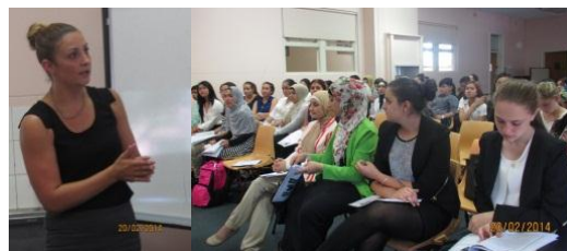
Work Ready day