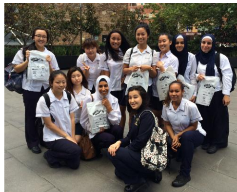
Students at the Big Day In conference at UTS

Last week a small group of Year 11 students attended the Big Day In conference at UTS where they heard presentations from guest speakers from the top technology companies in Australia. The students learnt about the vast field of career opportunities, current trends in information technology and where the future of technology is heading. This day was very beneficial, allowing us to learn about the innovative and wonderful world of technology and where a career in this industry can lead you. The fundamental requirements to succeed in this industry are an interest in technology, creativity and problem solving skills.