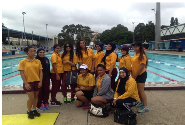
Year 10 PASS students