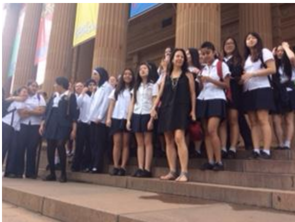
Visual Art excursion at the Art Gallery of NSW

In Week 3, our elective Year 10, 11 and 12 Visual Art students travelled to the city and visited the Art Gallery of NSW. The students attended the Pop to Popism exhibition, where more than 200 works explored the origins of pop art and gave the students the opportunity to see masterpieces by artists such as Andy Warhol and Roy Lichtenstein. Students also had the opportunity to see the Art Express display. This annual exhibition showcases exemplary artworks created by New South Wales visual art students for the Higher School Certificate.