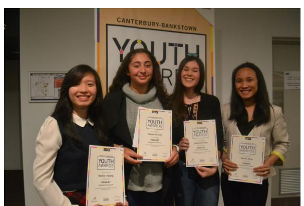
Bankstown Youth Awards