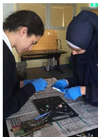
Year 11 Senior Science students dissecting a sheep's eye