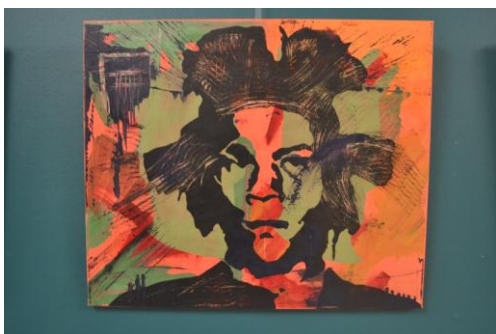
People's Choice Award