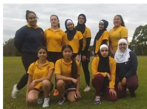
BGHS Oztag Teams