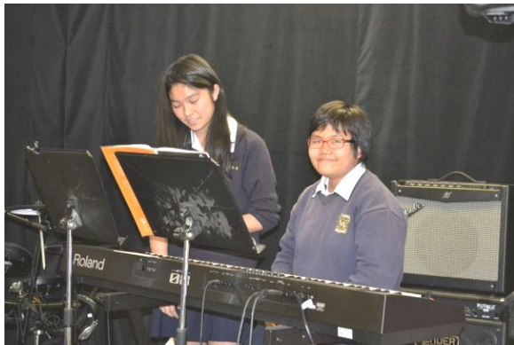
Music students performed at the CAPA Extravaganza