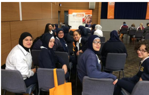
TAFE Open Day