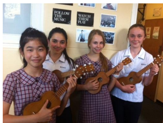
Music students with the newly acquired ukuleles

With HSC performances and exams now over, we have turned our focus to planning for next year. Last week saw the arrival of a new class set of ukuleles in the Music faculty. Stage 4 students (Year 7 and 8) will have the opportunity to participate in ukulele rehearsals during class. Ukuleles are very popular and fun to learn to play as a group. We will be learning about chords, strumming techniques and how to pick a melody! The "ukes" are especially suited to accompanying ourselves when we sing. You only need to learn 3 chords to play a huge range of songs! Listen out for our ukulele sounds wafting through the corridors and Tumbalong in 2017.