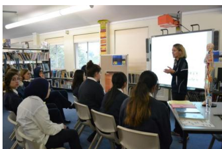
Year 10 students learning about their subject choices

Year 10 are currently making important decisions regarding subjects and courses for Year 11 2017. The girls have been assisted in this task through the information provided by the very successful Subject Market presented by Head Teachers and expert staff on Wednesday 20 July. At this market students were reminded that they should make their subject choices based on their interests and abilities . Selecting a subject because friends have chosen it, or family members believe it will lead to a high ATAR or even because a particular teacher is teaching it this year, are all foolish reasons on which to base a choice. The best predictors of HSC success are subject choices based on individual ability, interest and school attendance.