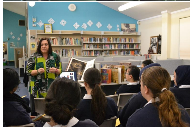
Year 10 Subject Selection Workshops