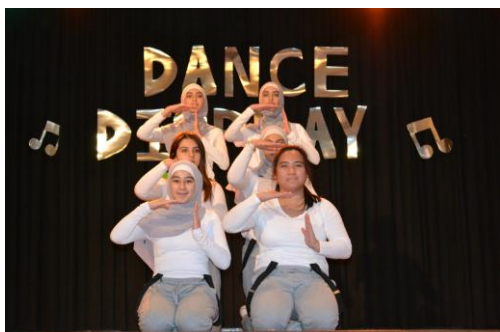
Year 9 students performing at the Dance Display