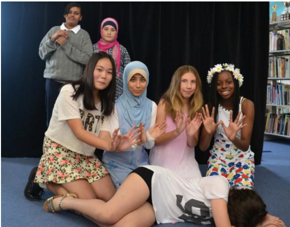
The cast of Echo and Narcissus

Last term was extremely busy in the library with the performance of Echo and Narcissus by the Time Travel History Club. In addition, more than 40 students made art to show their support for Aboriginal Reconciliation and celebrations were held for our best PRC readers.