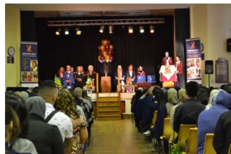
Year 12 Graduation Ceremony

On Thursday 21 September our Year 12 girls marked the end of their years at Birrong Girls at their Graduation Ceremony. This is a very special occasion on the school calendar; it marks the transformation of the bright eyed Year 7 students of 2012, into confident, independent young women ready to embrace the challenges of the future.