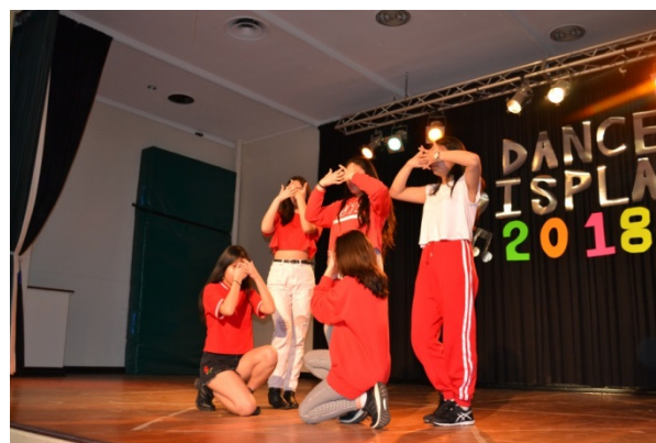
Best Senior Dance Group award winners - Year 9 - "Boss"

The dedication, talent, creativeness and inspiration of both the dancers and their PDHPE teachers ensured the Dance Display was a spectacular and extremely successful show. Well done to everyone involved!