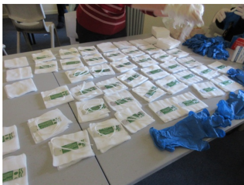
Assembly of birthing kits

The 5 th Annual Birthing Kits Assembly Workshop held on Saturday 23 June was a great success. Overall, 22 members of the Amnesty team, 14 school staff and their 9 children, 22 volunteers from Zonta Club of Sydney West and 3 ex-team members and siblings resulted in 70 dedicated people joining together in the biggest turnout so far. Birthing Kits Foundation Australia requested that we assemble 400 more kits resulting in an incredible 1400 birthing kits. This amazing achievement enables 1400 birthing kits, which include a plastic sheet to prevent a mother and baby coming into contact with the ground, soap, surgical gloves, a sterile scalpel blade, 3 strings for the umbilical cord and 5 clean gauze, to be sent to women in developing countries. Though basic, these materials make a real and substantial difference in providing clean and safe deliveries which significantly reduce the risk of infection, diseases and in some cases even death.