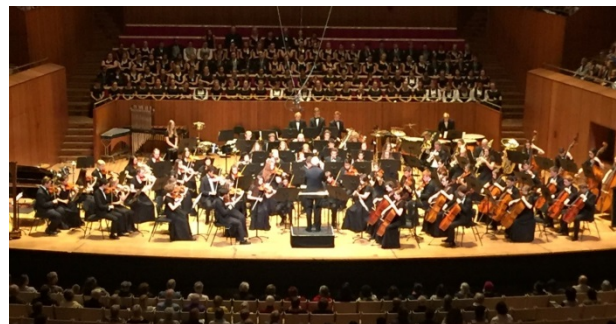
Sydney Opera House concert

On 22 June, Year 11 Music students had the privilege of attending the Sydney Opera House for a live concert. It was a fantastic opportunity for students to experience a full size orchestra, concert band and choir playing a range of different styles from classical music to jazz as well as some familiar movie themes. Students were able to observe how different orchestral instruments are used in various styles of music and how they can be utilised in composition to convey different emotions to the listener. It was an experience thoroughly enjoyed by all students and inspires young women in their musical appreciation and pursuits.