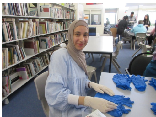
Volunteers wore gloves to ensure kits were sterile