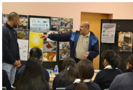
Year 10 Subject Selection Market

Year 10 students started the term with their Subject Selection Market where they were introduced to information about the range of courses they could select for their Year 11 Preliminary HSC course of study in 2019. Students gained valuable insights into the rigour required for all Preliminary courses before having to make their ultimate selections. The subject selection information session for Year 10 students and interested parents focused on the subject selection process, making appropriate course selections, Preliminary and HSC requirements and ATAR information to assist in the overall selection of 2019 courses. Year 10 students will be heading out of school to excursions for English, Commerce, PDHPE and Science over the next few weeks. A busy time indeed!