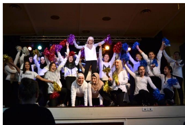
Best Lower School Class Dance award winners - 8S - "Hey Mickey"