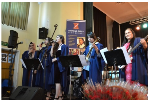
Year 12 Graduation

I wish the 2018 Year 12 girls the best of luck in their examinations and joy and success in their future studies and career paths.