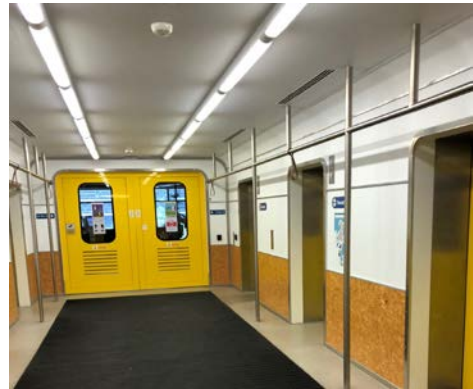
Google's lift foyer designed as a Sydney train

On 23 August two Year 10 Commerce classes got the opportunity to attend a tour of Google's headquarters in the city for an excursion. Firstly, students and teachers met at Birrong train station. We then made our way to Central and then took the light rail to The Star. When we arrived at Google's headquarters we were all welcomed with presentations from the employees and freebies. The presentations were very informative and elaborated on the wide variety of IT jobs available at Google. The panel members described their experiences and achievements. We were given an opportunity to ask them questions.