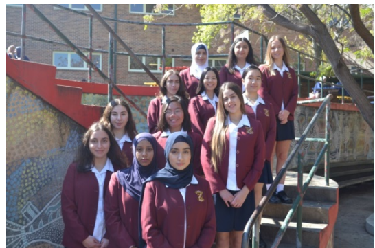
2019 Prefect Body