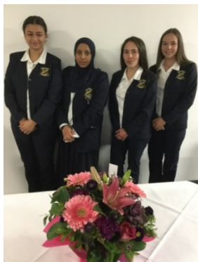
Students who assisted at the VET Awards