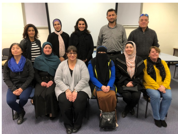
P&C meeting attendees