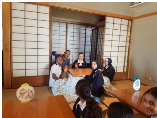
Enjoying a Japanese style heater - kotatsu!

We then finished our day with a trivia game as well as a game that involved a Japanese toy called a Kendama. Everyone really enjoyed these games as well as the chance to score points for our teams so that one team could be crowned the “winning” team for the day.