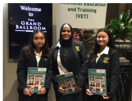
VET Award recipients