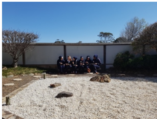
Enjoying our Obento in the Japanese garden

After making the Onigiri, we enjoyed a Japanese style lunch called an Obento in the beautiful Japanese garden. The Japanese garden was very zen (peaceful) and relaxing. We all got to try really yummy foods such as sushi, tempura, chicken katsu as well as one of the staples of all Japanese meals - gohan (rice)! We ate our Obento using ohashi (chopsticks) and tried to look as skilful as we could with various degrees of success! Ms Zoras had taught us how to use them in class and we tried to remember all the correct rules for using chopsticks.