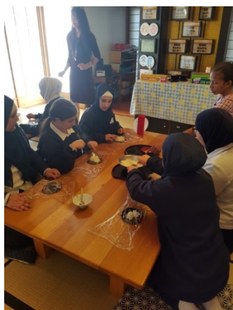
Making yummy Onigiri!

After our nervous interviews, the teams started their “friendly” competition to see who could gain the most points through a series of fun games. The first game was a Japanese dress up competition, followed by twister in Japanese as well as a Japanese food relay. We were then given the opportunity to learn how to make a Japanese snack called Onigiri. We made the delicious Onigiri with rice, tuna and nori (seaweed). We had a lot of fun trying to make them into the perfect triangular prism and really enjoyed eating them too!