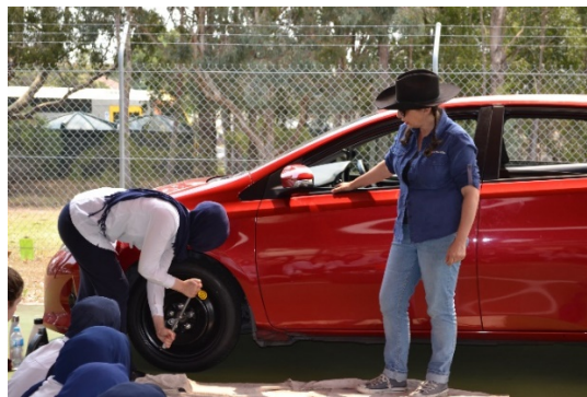
By: Amira Chahrouk, Sports Captain

highlighting the need to take time out for yourself and relax. Road safety was addressed in the car maintenance program where information about the safety and functions of a car were taught through engaging activities such as changing a tyre and addressing the features of a car. Family planning revisited the importance of sexual health and the responsible approaches needed to take in order for a reliable future. This program was engaging and informative in addressing the responsibilities for life outside of school.