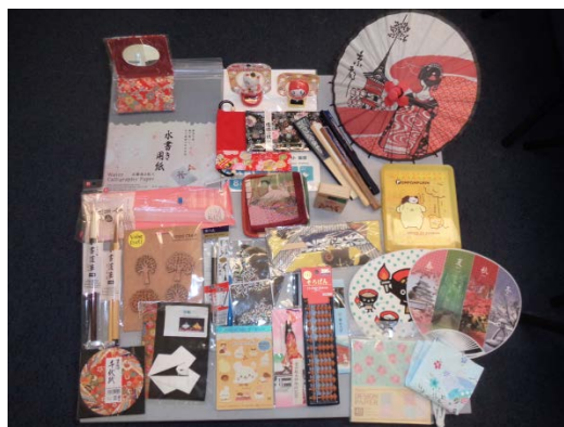
Book Week prizes on offer