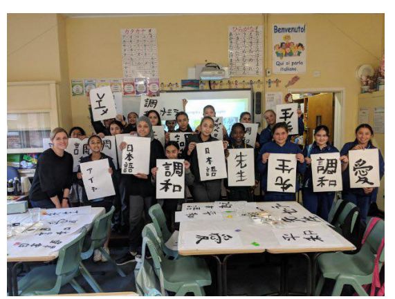
Year 6 Transition Program

Year 6 students from five local primary schools are participating in our transition program which was initiated on Thursday 29 August. The program will run over 4 mornings spread from Term 3 Week 6 to Term 4 Week 4. The program aims to support students to engage positively in and familiarise with our high school setting whilst meeting and interacting socially with future high school peers from surrounding primary schools. Students took part in a challenge activity and a specialised lesson.