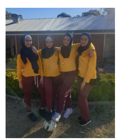
10 PASS \ students \\

On Wednesday 21 August 2019, Year 8 students participated in multiple sports at the annual field day carnival at Birrong Girls High School and Liverpool Girls High School. The sports played on the day were continuous cricket, basketball, soccer, netball and Newcombe ball. The day was made up of teams from Birrong Girls, Liverpool Girls, Bankstown Girls and East Hills Girls Technology High Schools.