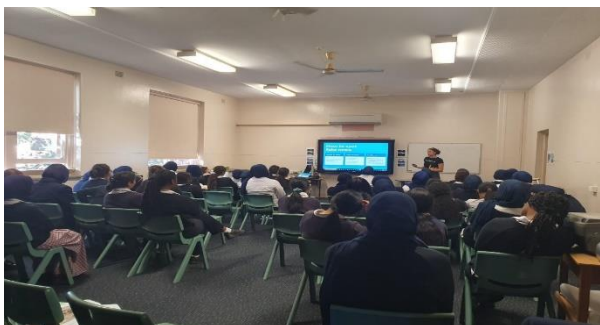
Optus Digital Thumbprint Workshop

It is very important to be aware of these topics so that your child is prepared and supported to thrive in the digital world. There is a range of free, downloadable Digital Thumbprint Parent Conversation Guides for parents and caregivers that support you to have effective conversations around what young people should and shouldn't share online, cyberbullying, and how digital technology can support effective study practices. To support this initiative and program, parents can obtain access to a variety of resources at home: Please visit: www.digitalthumbprint.com.au/parent-resources