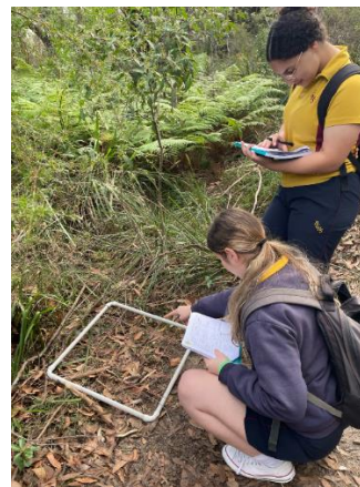
Ceren and Maya using a segmented quadrat to estimate the leaf litter coverage alongside the walking track