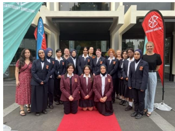
Finalists with BGHS staff at the Canterbury-Bankstown Youth Awards