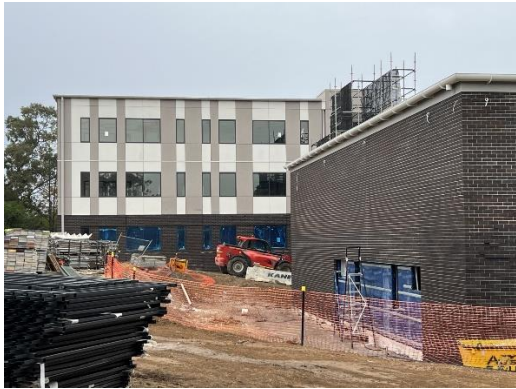
The hall is also looking wonderful and feeling so big.