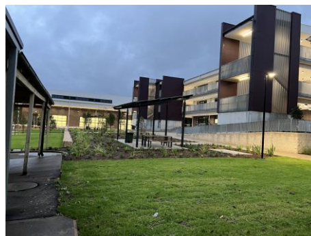
New Toilets attached to the Hall: